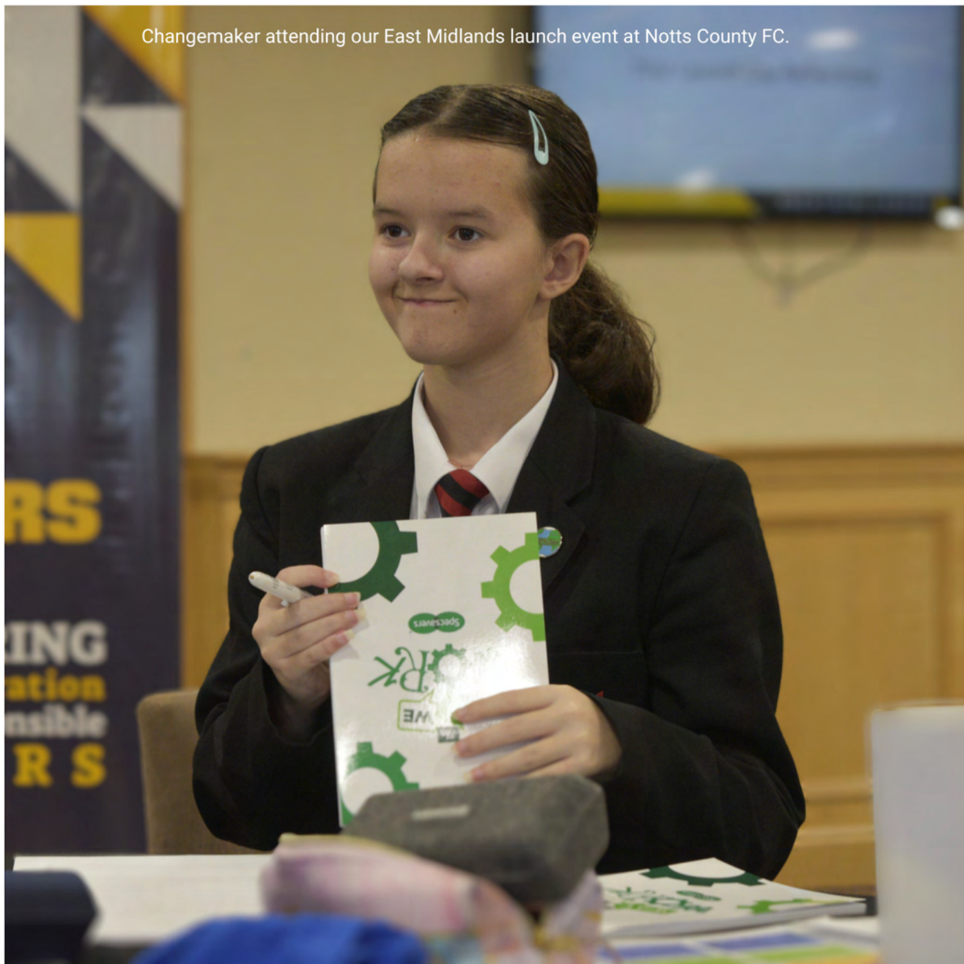
Changemaker attending our East Midlands launch event at Notts County FC.