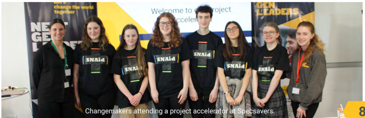
Changemakers attending a project accelerator at Specsavers.