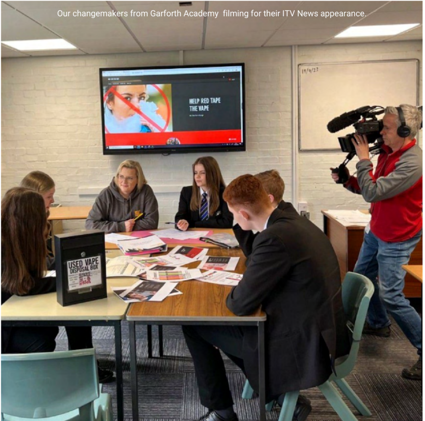
Our changemakers from Garforth Academy filming for their ITV News appearance.