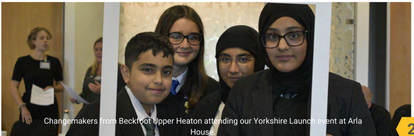
Changemakers from Beckfoot Upper Heaton attending our Yorkshire Launch event at Arla House.