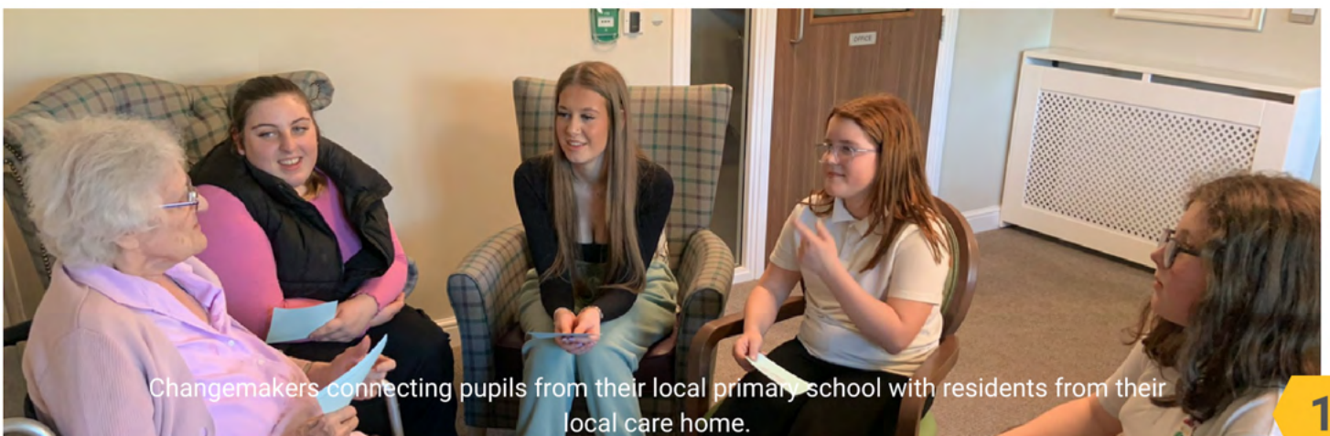
Changemakers connecting pupils from their local primary school with residents from their local care home.